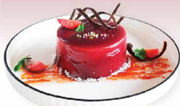
Kamardikan Cake (35K)